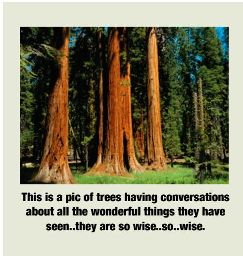
This is a pic of trees having conversations about all the wonderful things they have seen..they are so wise..so..wise.

I want to also make it clear that we do not hope to "solve" or "answer" every question one might have about the given topic of the night. Instead my hope is that you leave each night ready to ask even more questions and feel encourage that there are people